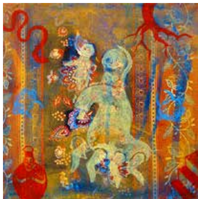
João Ribeiro (b. 1955, Portugal)

Untitled, Acrylic on canvas card, 30 x 22 cm, 2017 Ref.: JRB075