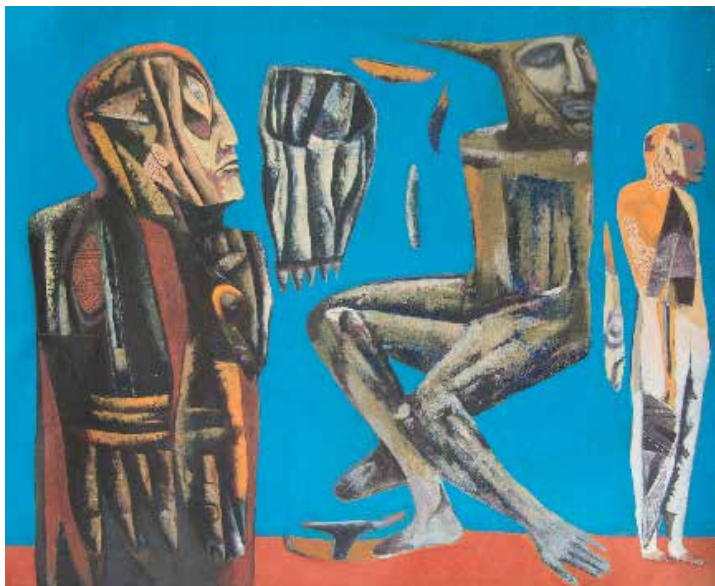
Miguel Huerta (b. 1964, Chile) El mundo azul de los habitantes sísmicos, Acrylic on canvas, 92 x 73 cm, 2014 Ref.: MH06