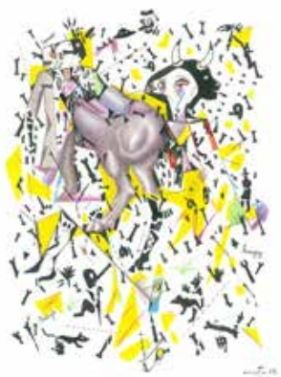
Aldo Alcota (b. 1976, Chile) From the series "Telluric Corporalities" Drawing on paper, 24,4 x 20,5 cm , 2018 Ref.: ALC87