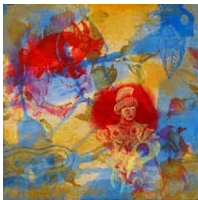
João Ribeiro (b. 1955, Portugal)

Untitled, Acrylic on canvas card, 30 x 22 cm, 2017 Ref.: JRB075