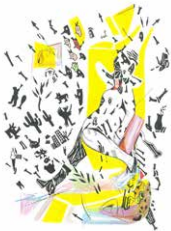
Aldo Alcota (b. 1976, Chile) Untitled Drawing on paper, 24 x 21,7 cm , 2017 Ref.: ALC76