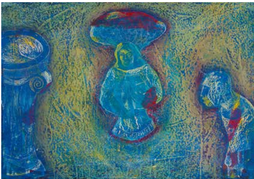
João Ribeiro (b. 1955, Portugal) Buddha under the fig, Acrylic and oil pastel on paper, 49,5 x 70 cm, 2014 Ref.: JRB020