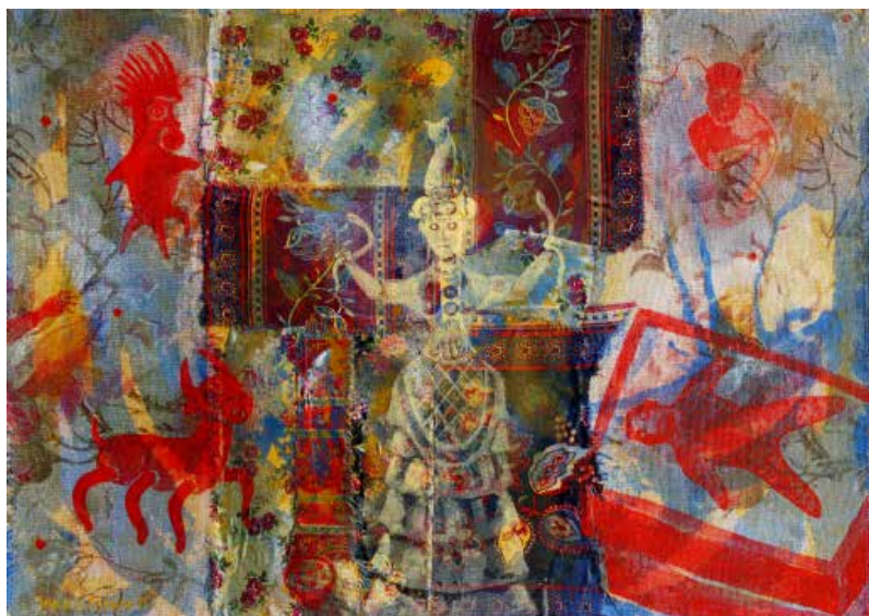
João Ribeiro (b. 1955, Portugal) The Virtue of Lita Mixed media on canvas with glued fabric, 37,5 x 52,5 cm, 2015 Ref.: JRB66