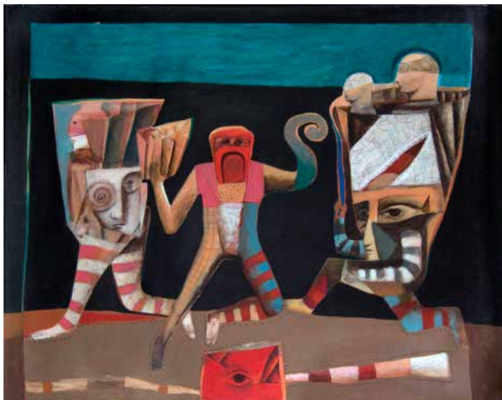
Miguel Huerta (b. 1964, Chile) Carnaval de los delirantes habitantes de un mundo paralelo, Acrylic on canvas, 92 x 72 cm, 2015 Ref.: MH002