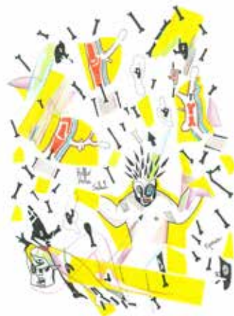
Aldo Alcota (b. 1976, Chile) Untitled Drawing on paper, 24 x 21,7 cm , 2017 Ref.: ALC78