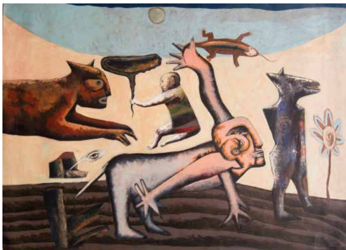
Miguel Huerta (b. 1964, Chile) Los mensajeros de un continente escondido, Acrylic on canvas, 70 x 100 cm, 2015 Ref.: MH004