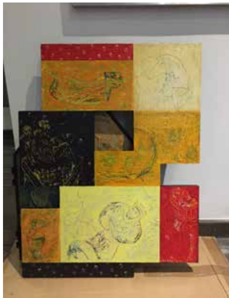
João Ribeiro (b. 1955, Portugal) Portal, Mixed media on wood, 72 x 55 cm, 2005 Ref.: JRB106