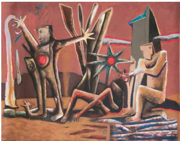
Miguel Huerta (b. 1964, Chile) Untitled, Acrylic on canvas, 89 x 60 cm, n.d. Ref.: MH011