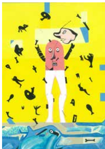
Aldo Alcota (b. 1976, Chile) Untitled Acrylic on canvas card, 30 x 22 cm , 2017 Ref.: ALC73