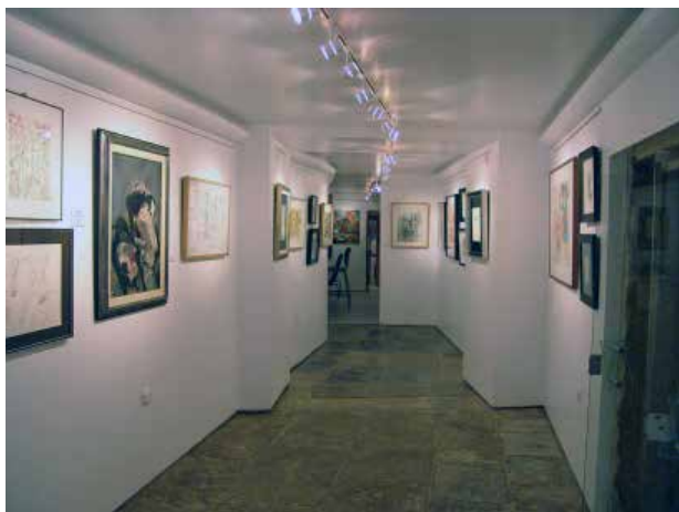
Perve Galeria in Lisbon, Portugal