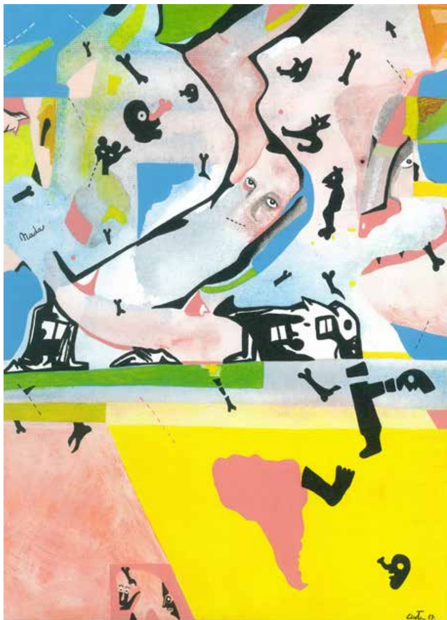
Aldo Alcota (b. 1976, Chile) Untitled Acrylic on canvas card, 30 x 22 cm , 2017 Ref.: ALC88