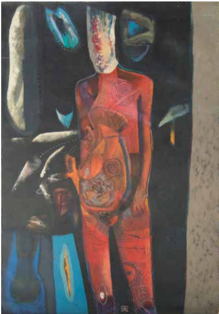
Miguel Huerta (b. 1964, Chile) Los mensajeros de un continente escondido, Acrylic on canvas, 104 x 76 cm, n.d. Ref.: MH012