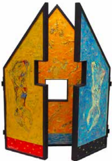
João Ribeiro (b. 1955, Portugal) Oratory, Mixed media on wood, 280 x 60 cm, 2017 Ref.: JRB82