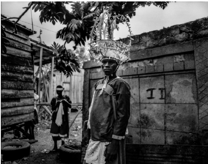
Untitled Danço Congo (2016) hahnemuehle Baryta FB 60 x 80cm