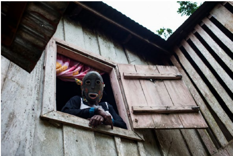
Untitled Danço Congo (2018) hahnemuehle Baryta FB 40 x 50cm