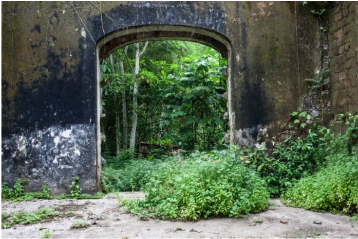
Untitled (2016) hahnemuehle Baryta FB 60 x 80cm