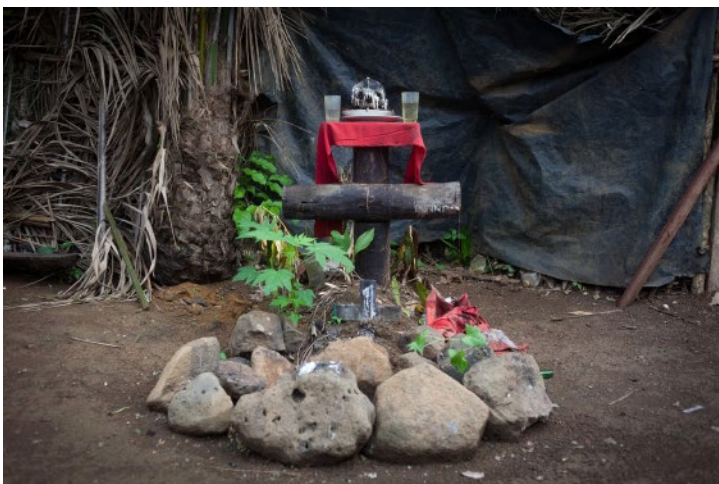
Untitled Danço Congo (2018) hahnemuehle Baryta FB 60 x 80cm