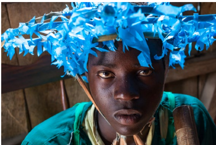
Untitled Danço Congo (2016) hahnemuehle Baryta FB 50 x 60cm