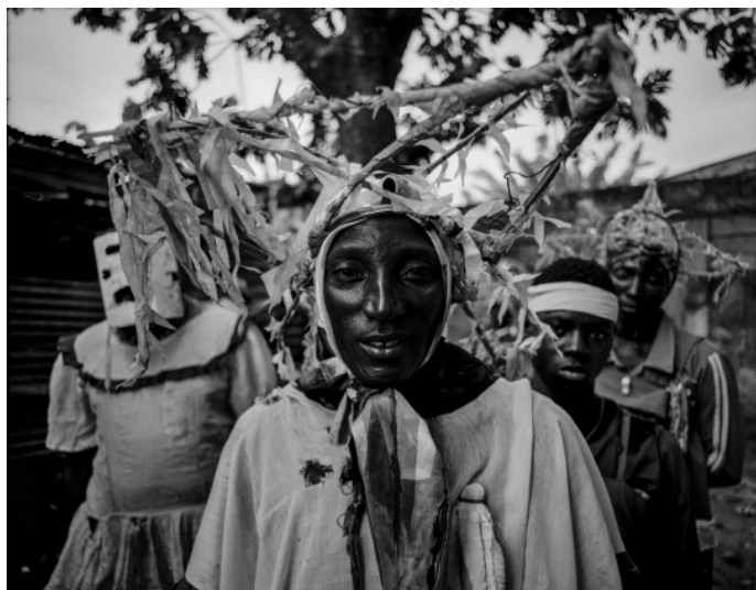
Untitled Danço Congo (2016) hahnemuehle Baryta FB 50 x 60cm