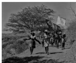
Epson Fine Art Cotton 20 x 30 cm