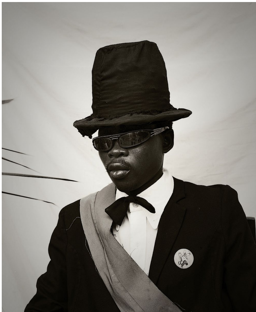
Untitled Tchilóli (1997) hahnemuehle Baryta FB 50 x 40cm