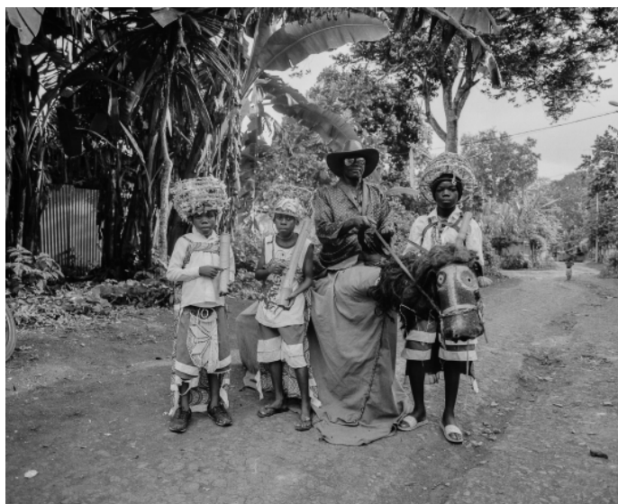
Untitled Danço Congo (2018) hahnemuehle Baryta FB 50 x 60cm