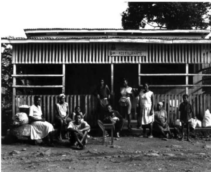
Untitled Págá Dêvê (1997) hahnemuehle Baryta FB 50 x 60cm