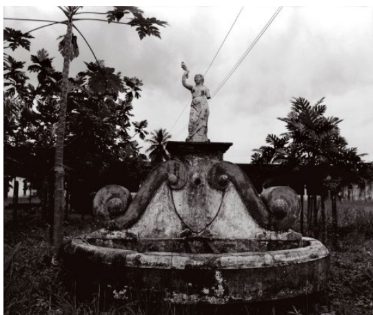
Untitled Capital (2000) hahnemuehle Baryta FB 40 x 50cm