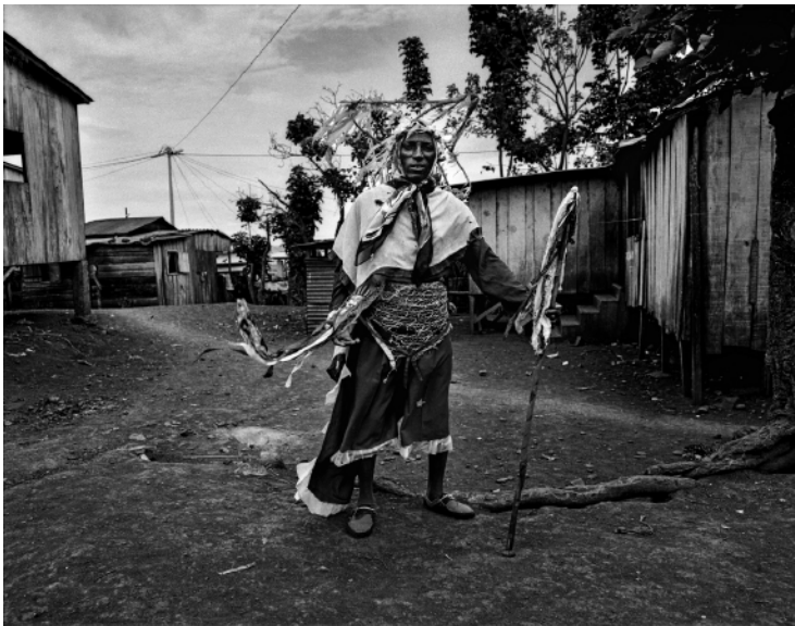
Untitled Danço Congo (2016) hahnemuehle Baryta FB 60 x 80cm