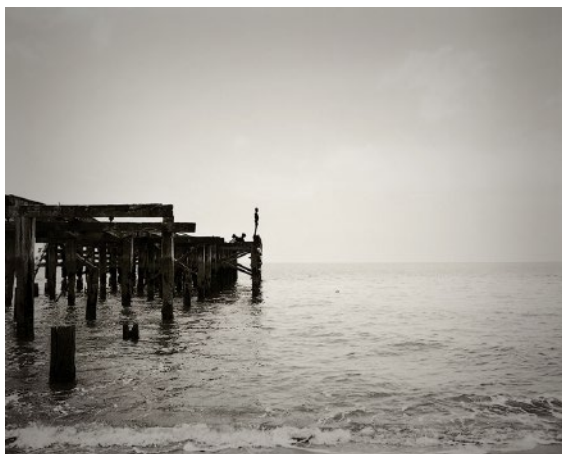
Sem título (2010) hahnemuehle Baryta FB 60 x 80cm