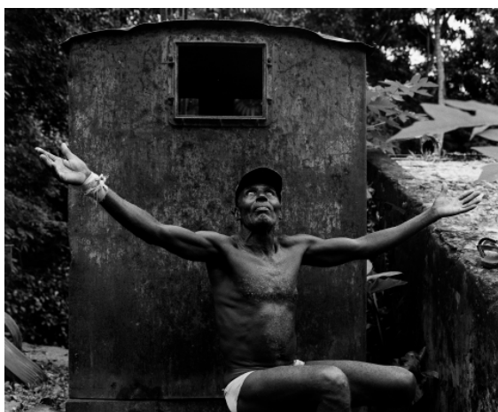
Untitled Págá Dêvê (1997) hahnemuehle Baryta FB 60 x 80cm