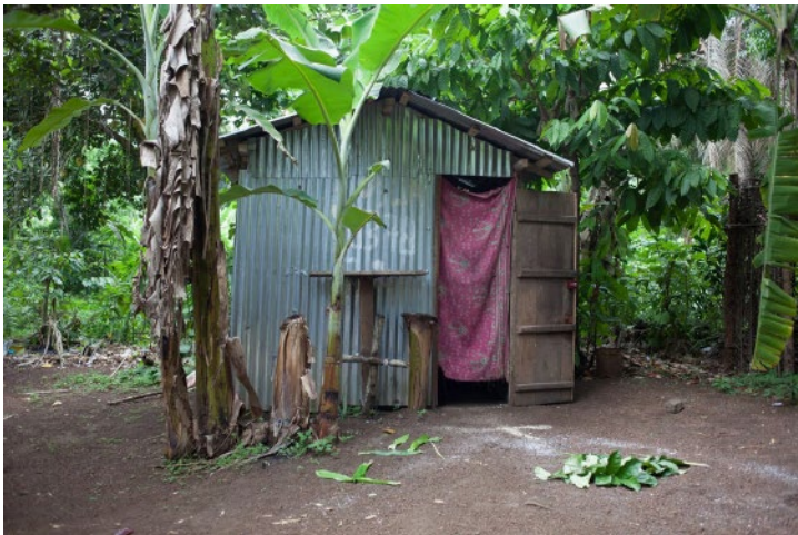
Untitled Danço Congo (2018) hahnemuehle Baryta FB 60 x 80cm