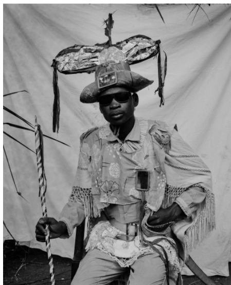
Untitled Tchilóli (1997) hahnemuehle Baryta FB 50 x 40cm

www.pervegaleria.eu galeria@pervegaleria.eu Rua das Escolas Gerais nº 13 - Alfama 1100-218 Lisboa | Portugal Schedule: 2.ª a sábado das 14h às 20h T: 218822607/8 | Tm: 912521450