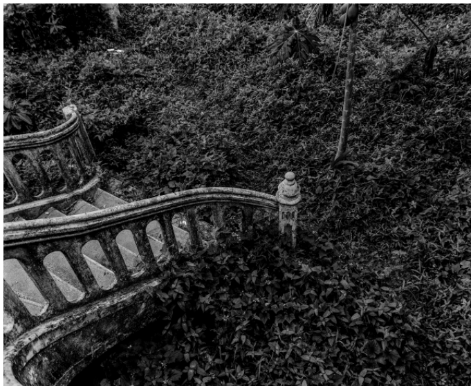
Untitled Capital (2000) hahnemuehle Baryta FB 50 x 60cm