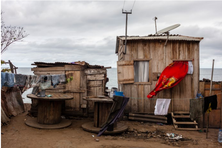
Untitled (2016) hahnemuehle Baryta FB 60 x 80cm