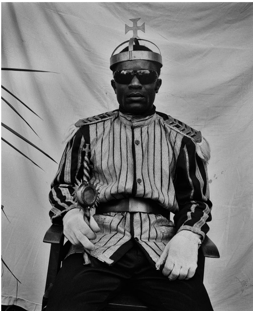
Untitled Tchilóli (1997) hahnemuehle Baryta FB 50 x 40cm