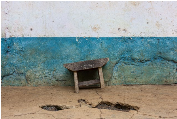
Untitled (2016) hahnemuehle Baryta FB 60 x 80cm