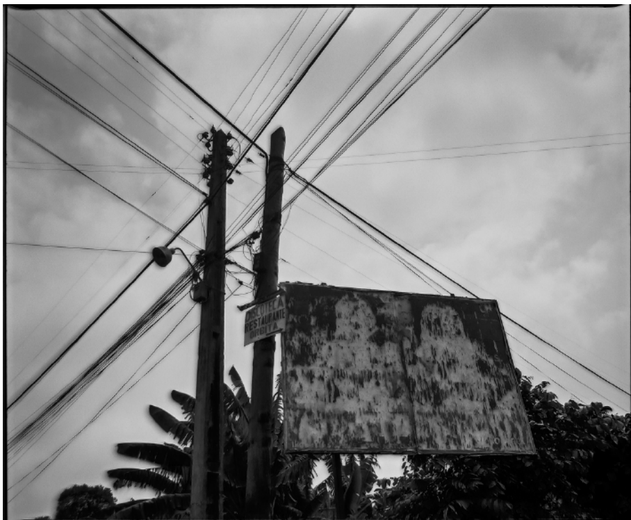
Untitled Rua Nigéria (2010) hahnemuehle Baryta FB 40 x 50cm