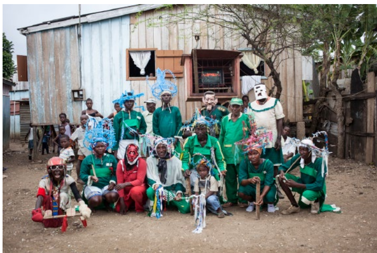
Untitled Danço Congo (2016) hahnemuehle Baryta FB 50 x 60cm