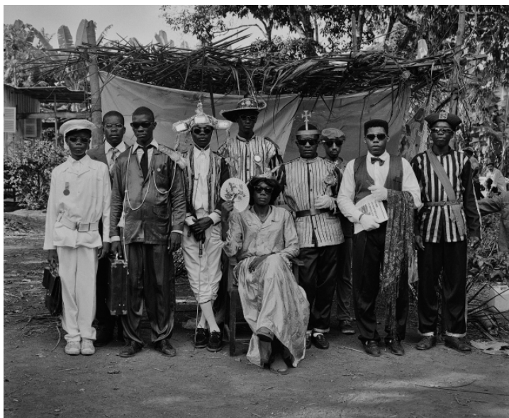
Untitled Tchilóli (1997) hahnemuehle Baryta FB 40 x 50cm