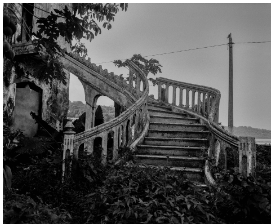
Untitled Capital (2000) hahnemuehle Baryta FB 40 x 50cm