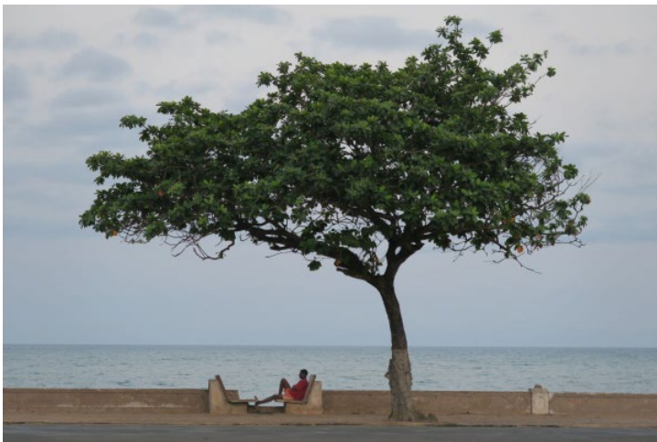
Untitled (2016) hahnemuehle Baryta FB 60 x 80cm