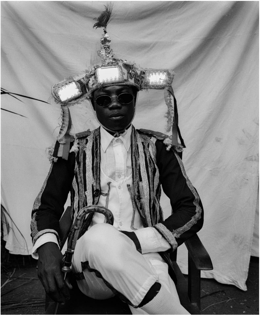
Untitled Tchilóli (1997) hahnemuehle Baryta FB 80 x 60cm