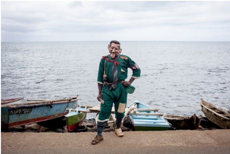
Untitled Danço Congo (2016) hahnemuehle Baryta FB 40 x 50cm