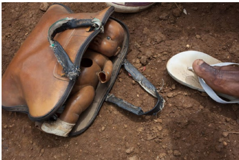
Untitled Danço Congo (2018) hahnemuehle Baryta FB 40 x 50cm