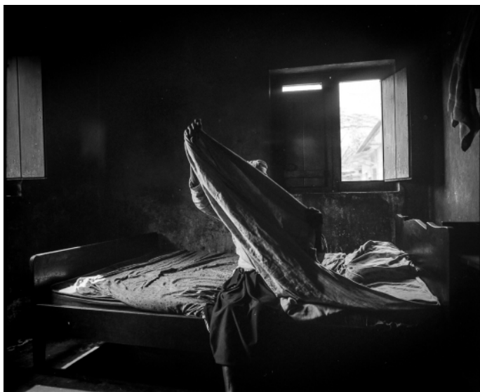
Sem título (2018) hahnemuehle Baryta FB 50 x 60cm