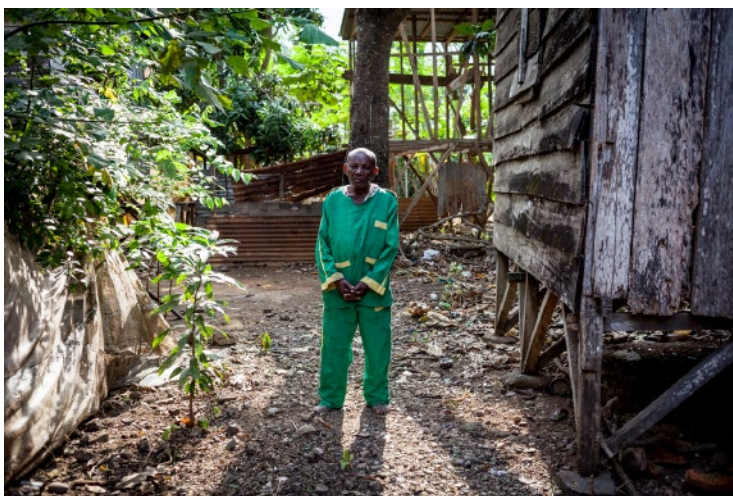
Untitled Danço Congo (2016) hahnemuehle Baryta FB 50 x 60cm