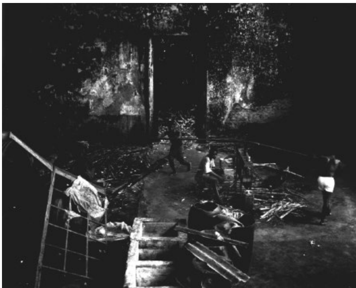
Untitled Págá Dêvê (1997) hahnemuehle Baryta FB 50 x 60cm