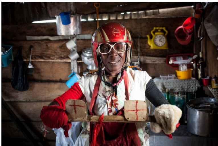
Untitled Danço Congo (2016) hahnemuehle Baryta FB 40 x 50cm