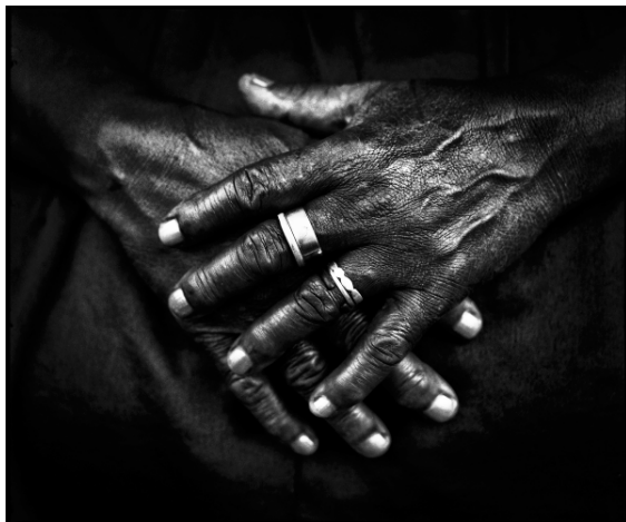
Untitled Págá Dêvê (1997) hahnemuehle Baryta FB 60 x 80cm