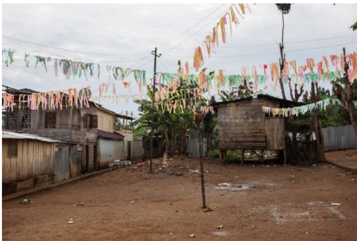
Untitled Danço Congo (2018) hahnemuehle Baryta FB 50 x 60cm