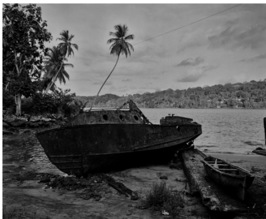
Untitled Capital (2000) hahnemuehle Baryta FB 40 x 50cm