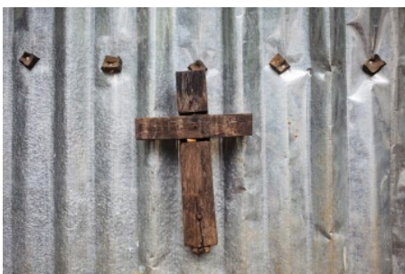
Epson Fine Art Cotton 20 x 30 cm