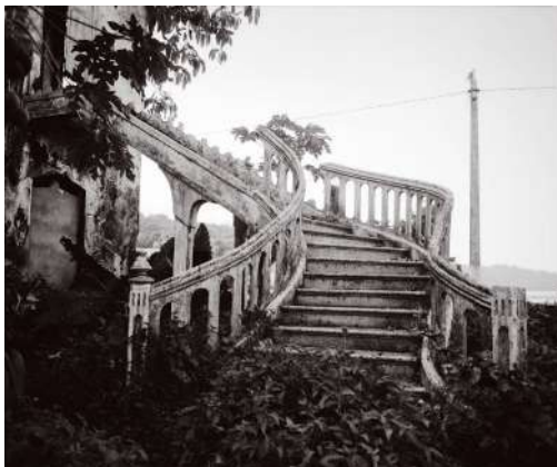
José Chambel (b. 1969) Untitled (Capital series) , 2000 Black and White Photography, Epson Ultrachrome Printing, ed. 1/6, 40 x 50 cm. Ref.: JCH001