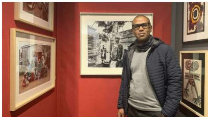
Fotógrafo são-tomense, José Chambel RFI