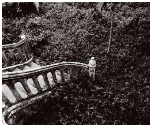
José Chambel (b. 1969) Untitled (Capital series) , 2000 Black and White Photography, Epson Ultrachrome Printing, ed. 1/6, 40 x 50 cm. Ref.: JCH005