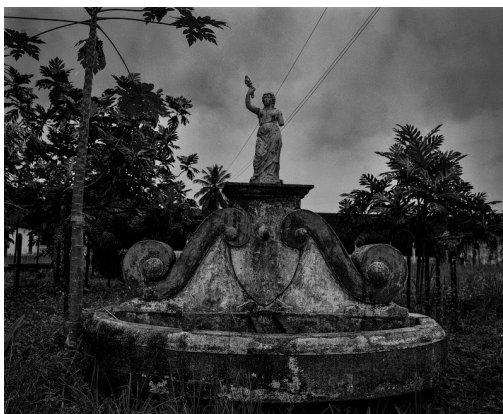
José Chambel (b. 1969) Untitled (Capital series) , 2000 Black and White Photography, Epson Ultrachrome Printing, ed. 1/6, 40 x 50 cm. Ref.: JCH008